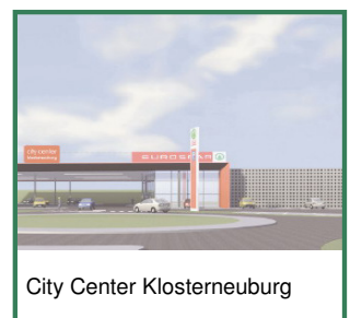
City Center Klosterneuburg